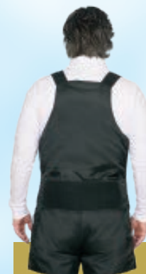
Power Pleated padded stretch back