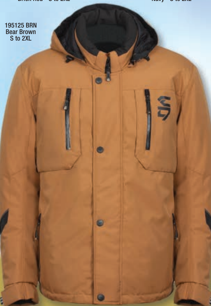
195125 BRN Bear Brown S to 2XL