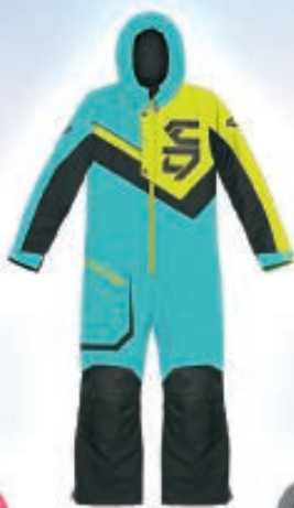
124724 5SF Lake Green Safety Lime 8 to 18