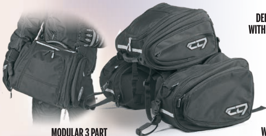
MODULAR 3 PART SADDLEBAG

ALL OUR LUGGAGE ARE MADE FROM HIGH DENIER CORDURA BACKED WITH PVC COATING FOR DURABILITY AND WEAR, AND ARE