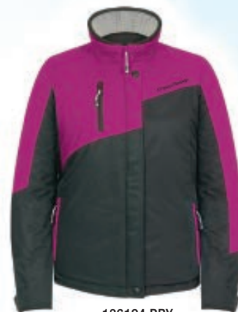
186124 BRY Berry - XS to 2XL