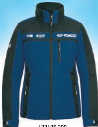
122125 200 Navy - 6 to 18