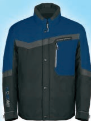
196124 220 Navy - S to 2XL