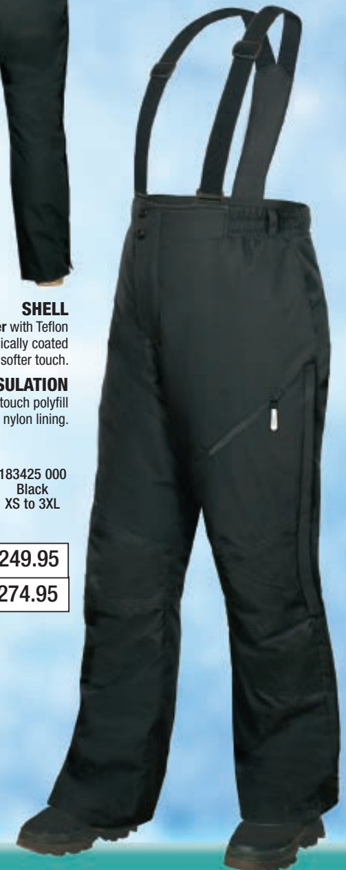
183425 000 Black XS to 3XL

150 gr. (5.5 oz.) Feather touch polyfill insulation with nylon lining.