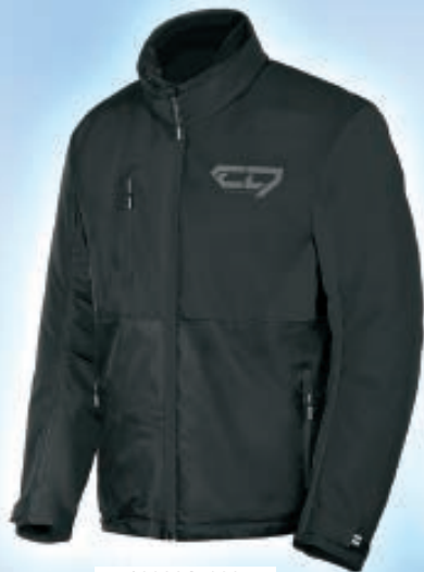
199824 000 Black - S to 7XL