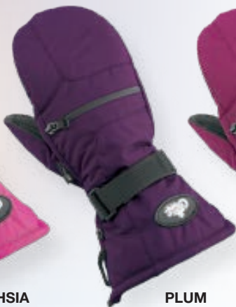
PLUM # 222108 3D xs to xl (8 to 16)