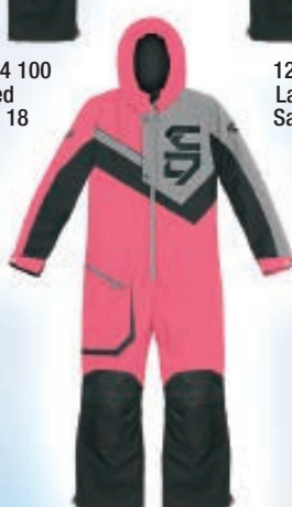
124724 8R0 Rose Red - 8 to 18