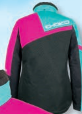
181123 5H8 Lake Green / Fuchsia XS to 2XL