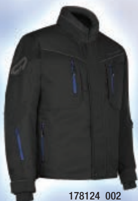
178124 002 Black-Royal zippers - S to 2XL