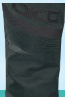
Articulated knee patches with power pleating