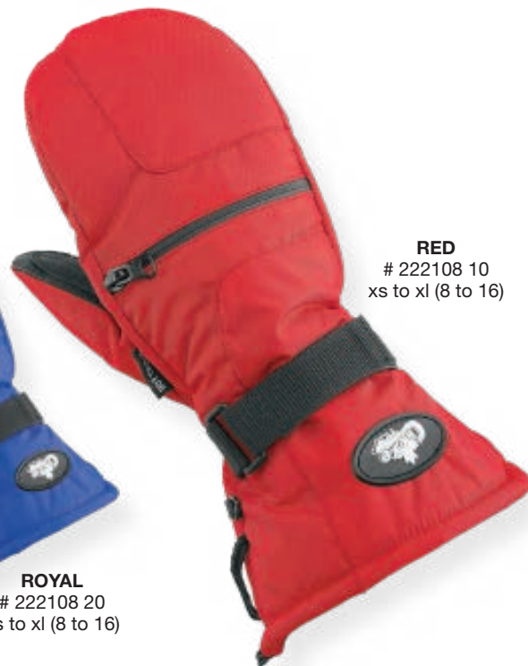
RED # 222108 10 xs to xl (8 to 16)

YOUTH : # 222148 sizes xs to xl (8 to 16)