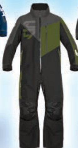
191724 OLV Olive - S to 2XL