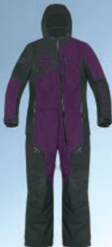
183724 3DK Plum - XS to 2XL