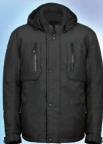
195125 000 Black - S to 3XL