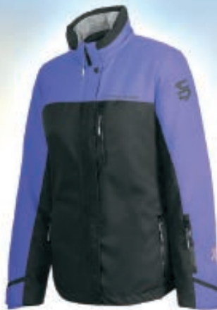
185825 300 Lilac - XS to 2XL