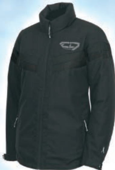
183125 000 Black - XS to 3XL