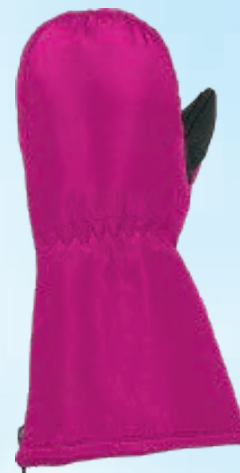
FUCHSIA # 222201 H8 sizes s to l (2 to 6)