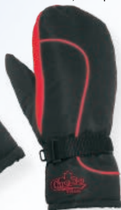
RED # 10