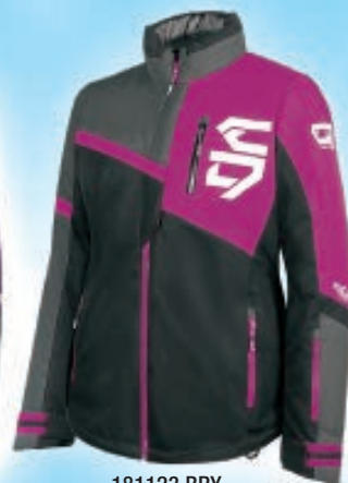
181123 BRY Berry - XS to 2XL