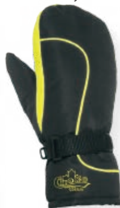
SAFETY LIME # SF