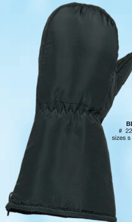
BLACK # 222201 00 sizes s to l (2 to 6)

YOUTH : # 225148 sizes xs to xl (8 to 16)