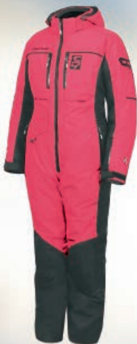
184725 8R0 Rose Red - XS to 2XL