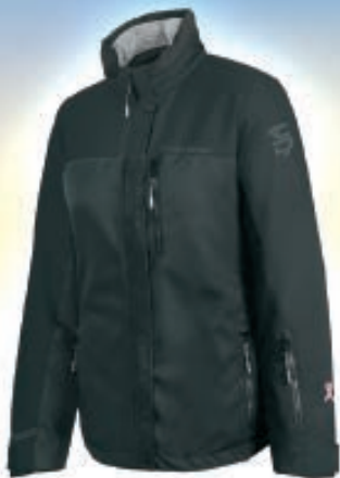
185825 000 Black - XS to 3XL