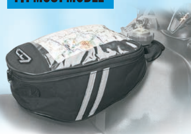
TANK BAG/ MAP POUCH # 203008 00 CA$59.95