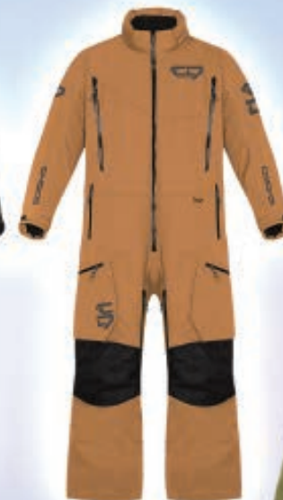
170724 BRN Bear Brown S to 2XL