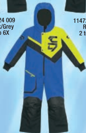
114724 200 Royal 2 to 6X