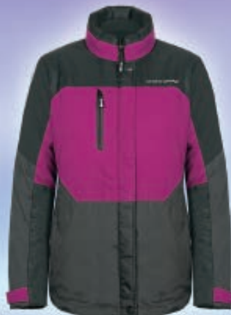
189824 BRY Berry - XS to 2XL