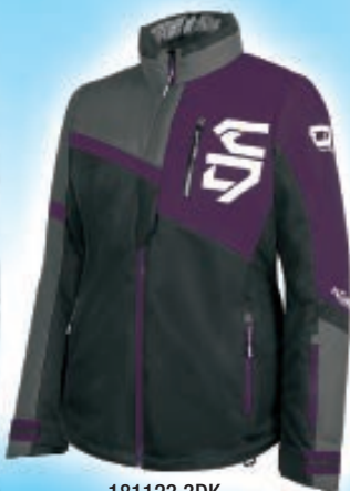
181123 3DK Plum - XS to 2XL