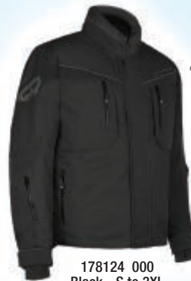
178124 000 Black - S to 3XL