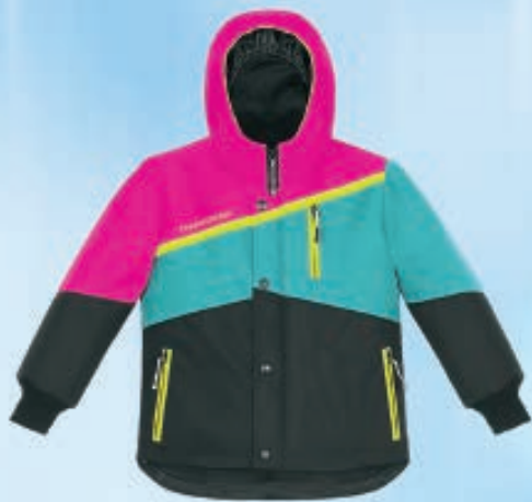
111824 H85 Fuchsia / Lake Green - 2 to 6X