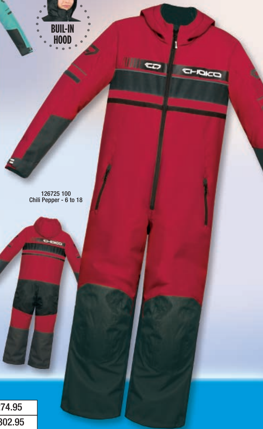
126725 100 Chili Pepper - 6 to 18