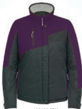
186124 3DK Plum - XS to 2XL