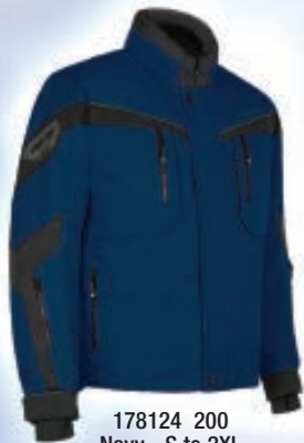
178124 200 Navy - S to 2XL