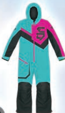
124724 5H8 Lake Green Fuchsia 8 to 18