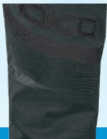
Articulated knee patches with power pleating