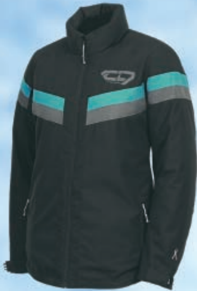
183125 500 Lake Green - XS to 3XL