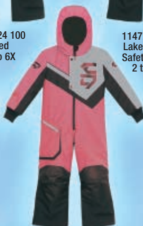
114724 8R0 Rose Red 2 to 6X