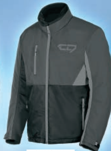
199824 900 Grey - S to 5XL