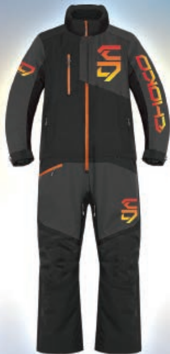
190725 09H Black/Grey/Flame print S to 3XL