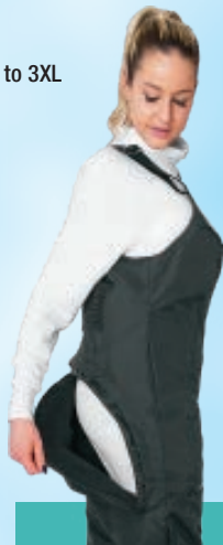
New zipper drop-seat opening for a slimmer look