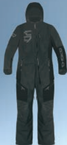
183724 000 Black - XS to 3XL