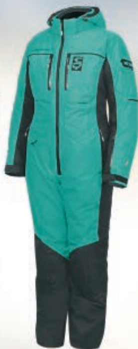
184725 500 Lake Green - XS to 2XL