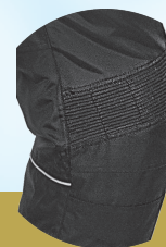
Triple padded articulated knee patches with power pleating