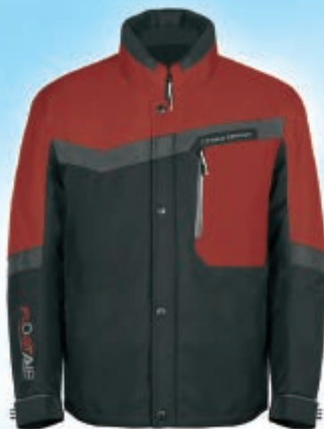
196124 110 Brick Red - S to 2XL