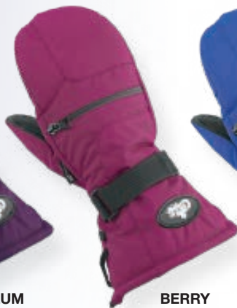
BERRY # 222108 BR xs to xl (8 to 16)