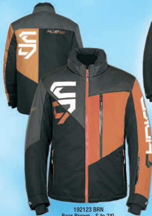
192123 BRN Bear Brown - S to 2XL