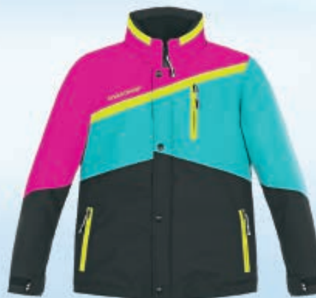
121824 H85 Fuchsia / Lake Green - 8 to 18