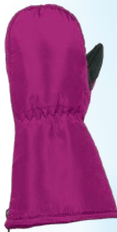
BERRY # 222201 BR sizes s to l (2 to 6)