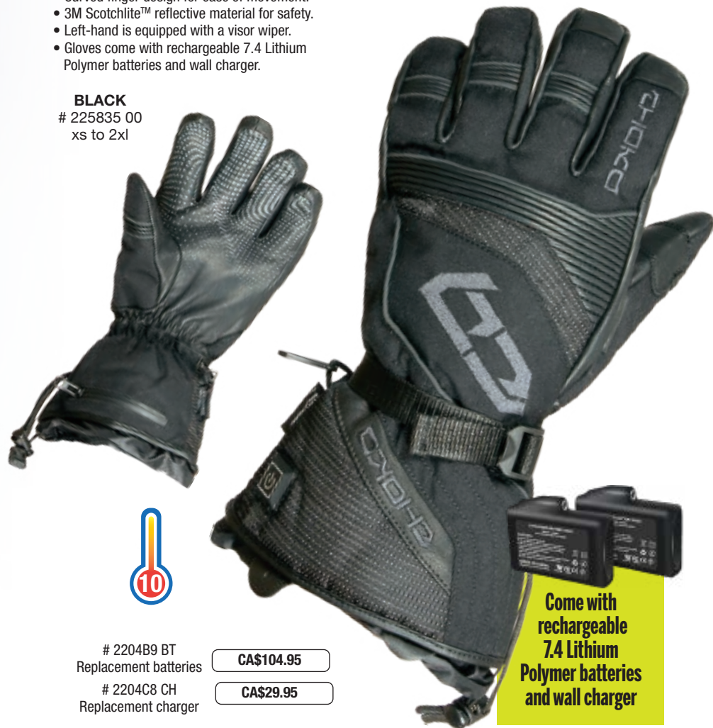
BLACK # 225835 00 xs to 2xl