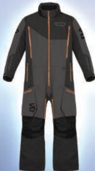
170724 90R Grey/Orange zips S to 2XL