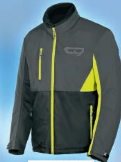
199824 SFT Safety Lime - S to 2XL