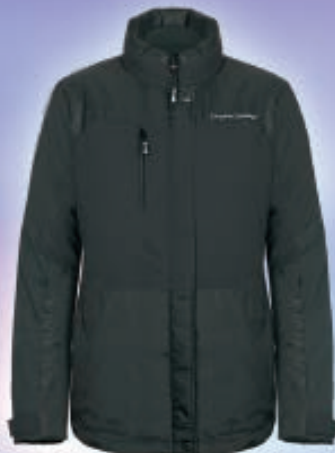
189824 000 Black - XS to 3XL