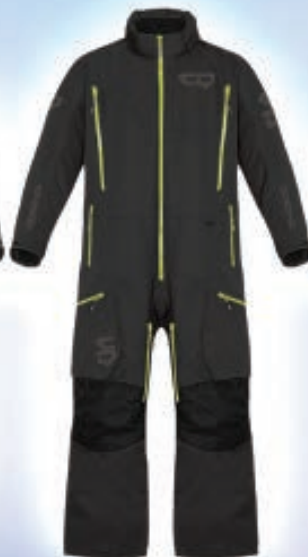
170724 0SF Black/Lime zippers S to 2XL