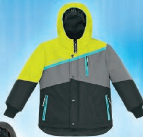
111824 SFT Safety Lime - 2 to 6X