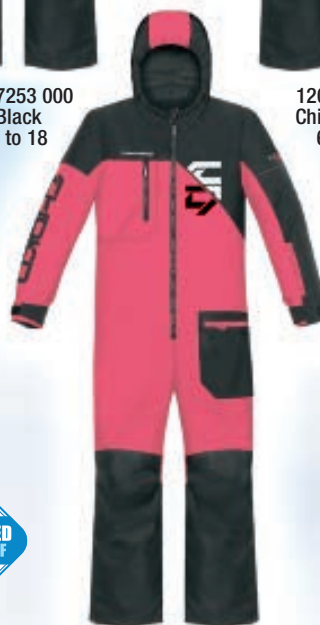
120725 8R0 Rose Red - 6 to 18