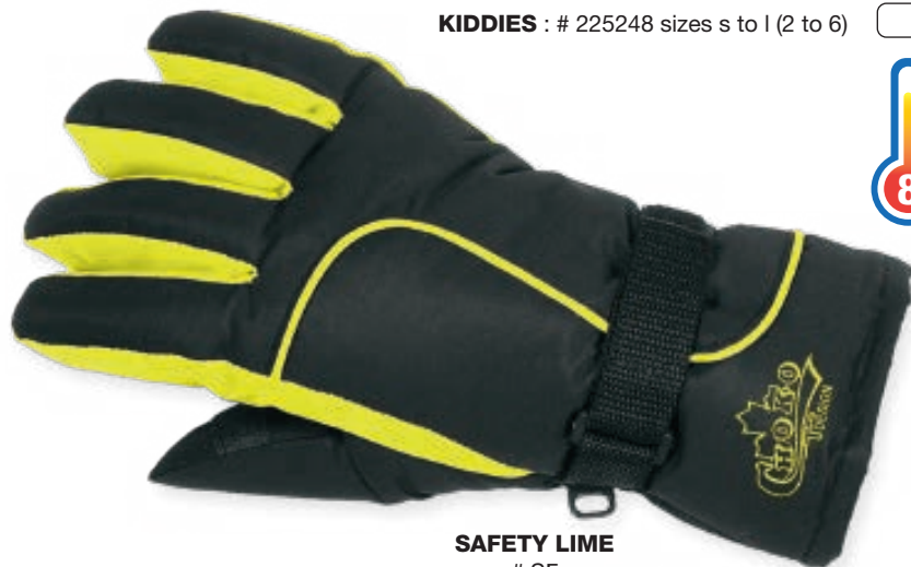
SAFETY LIME # SF