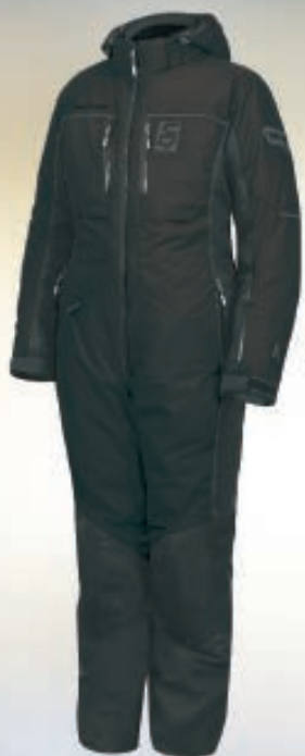
184725 000 Black - XS to 3XL