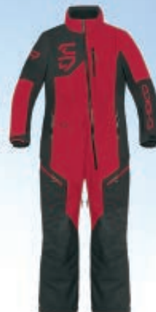
183724 100 Chili Pepper - XS to 2XL