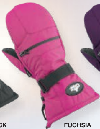
FUCHSIA # 222108 H8 xs to xl (8 to 16)