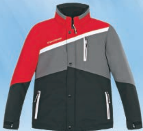
121824 100 Red - 8 to 18