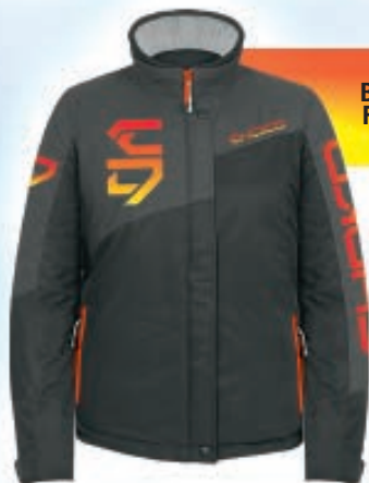
186124 09H Black/Grey/ Flame Print S to 3XL