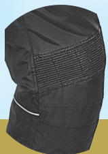
Triple padded articulated knee patches with power pleating