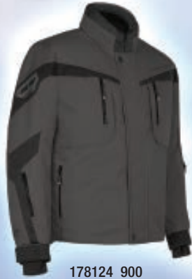
178124 900 Dark Grey - S to 3XL