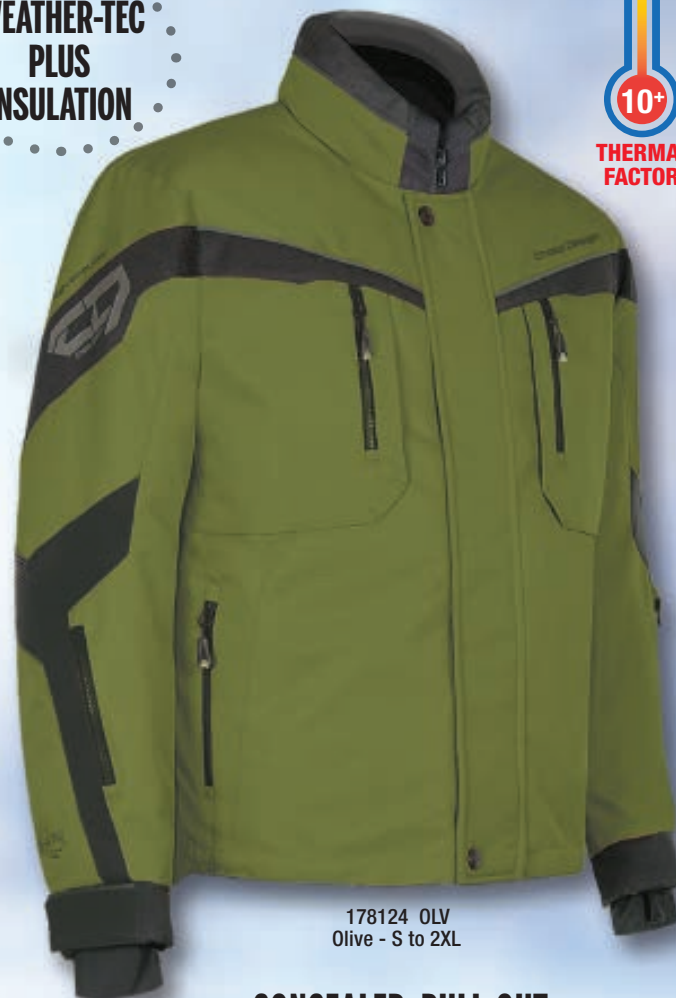
178124 0LV Olive - S to 2XL