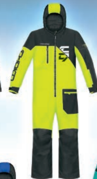
120725 SFT Safety Lime 6 to 18