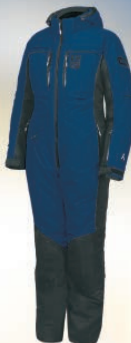
184725 200 Navy - XS to 2XL