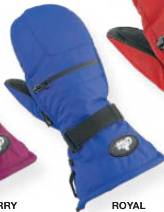
ROYAL # 222108 20 xs to xl (8 to 16)