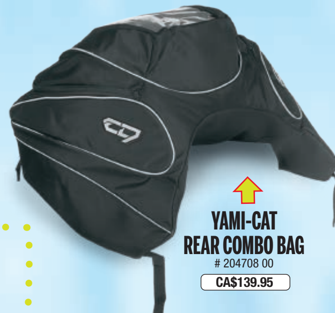
➔ YAMI-CAT REAR COMBO BAG # 204708 00 CA$139.95