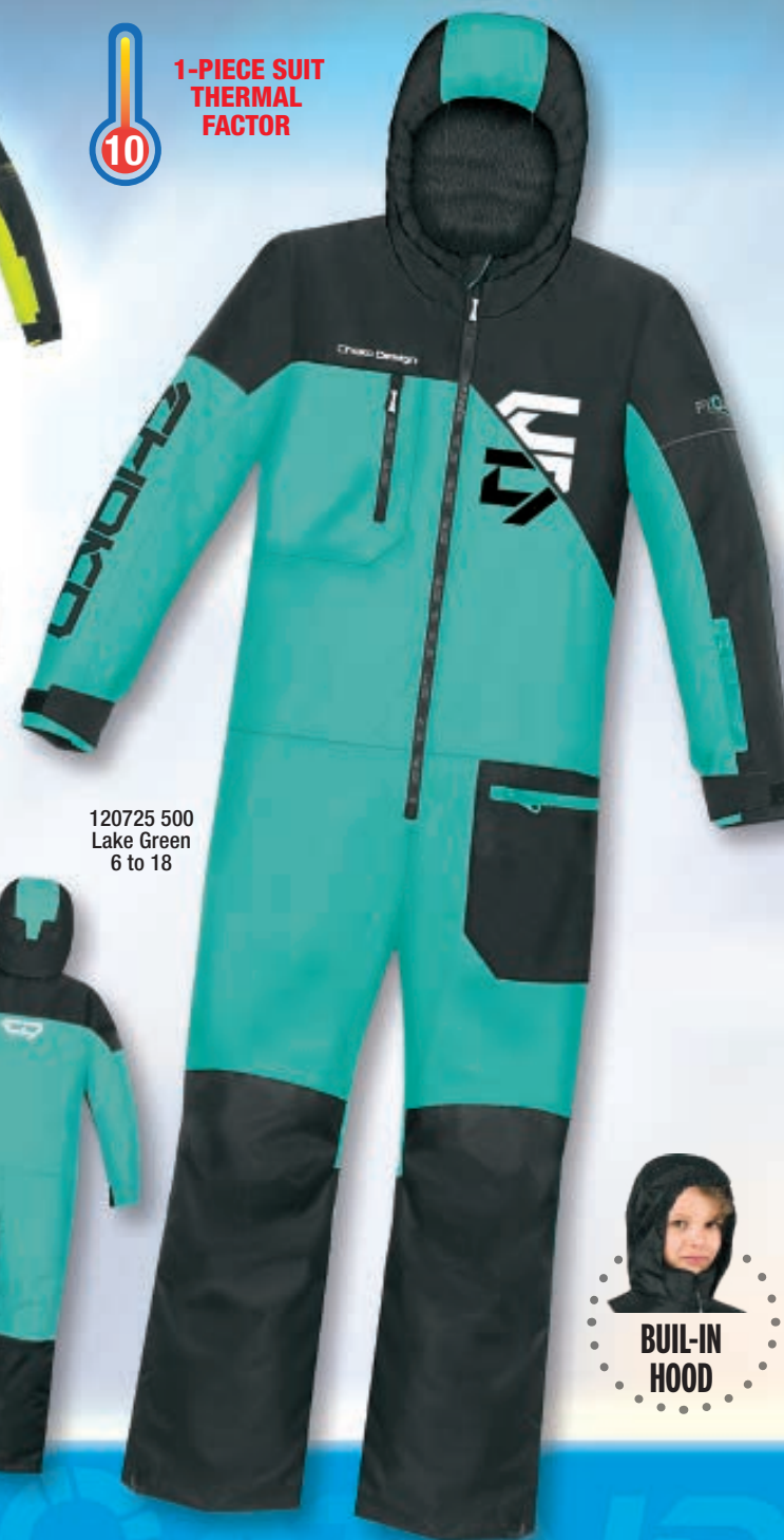
120725 500 Lake Green 6 to 18