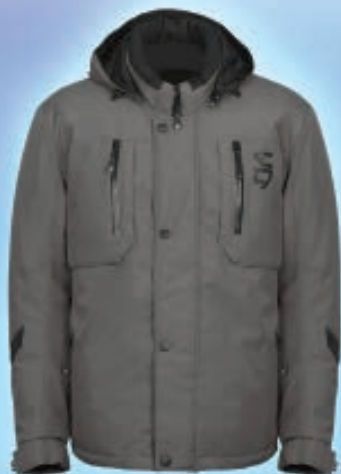
195125 900 Grey - S to 2XL