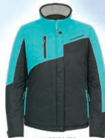
186124 500 Lake Green - XS to 2XL