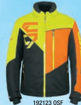
192123 0SF Orange/Safety Lime - S to 2XL