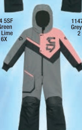
114724 9C0 Grey/Coral 2 to 6X