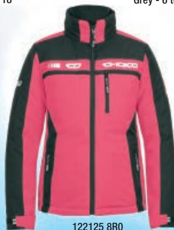
122125 8R0 Rose Red - 6 to 18