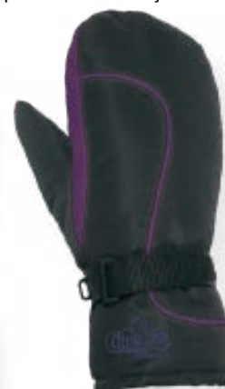
PLUM # 3D