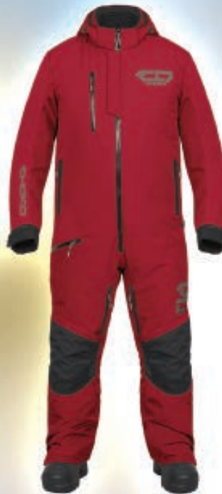
190725 100 Chili Pepper - S to 2XL