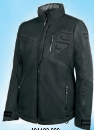
181123 000 Black - XS to 3XL