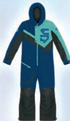
124724 250 Navy Lake Green 8 to 18