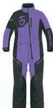
183724 300 Lilac - XS to 2XL