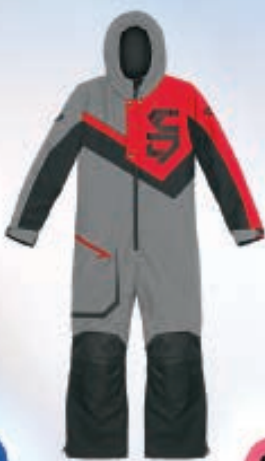
124724 100 Red 8 to 18