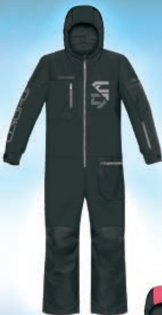
1207253 000 Black 6 to 18