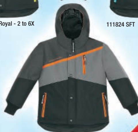
111824 900 Grey - 2 to 6X