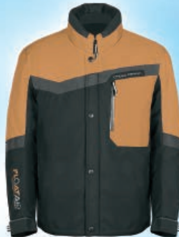
196124 BRN Bear Brown - S to 2XL