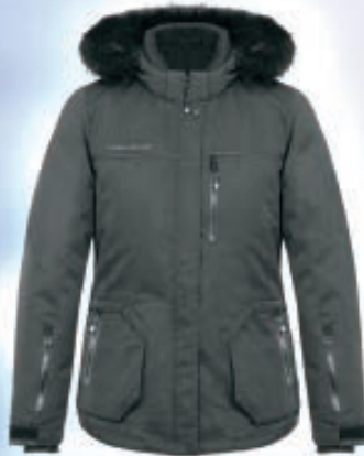
187125 900 Dark Grey - XS to 2XL