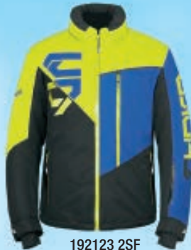
192123 2SF Royal/Safety Lime - S to 2XL