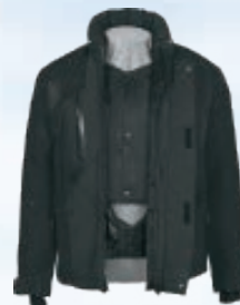
BUILT-IN WIND SHIELD VEST