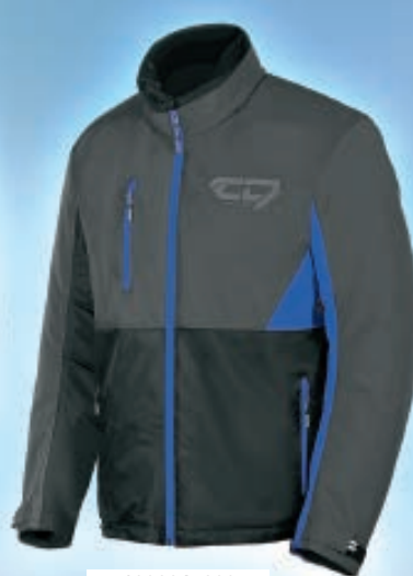
199824 200 Royal - S to 2XL