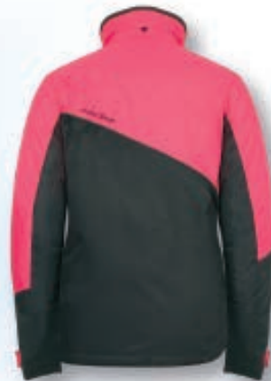
186124 8R0 Rose Red - XS to 2XL