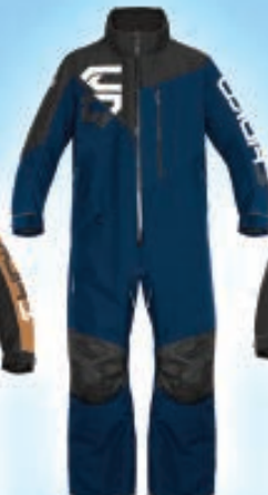
191724 220 Navy - S to 2XL