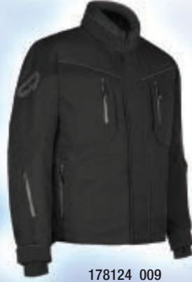
178124 009 Black-Grey zippers - S to 2XL