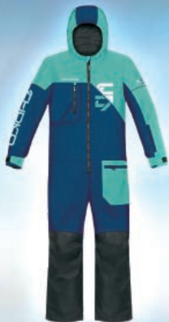
120725 250 Navy / Lake Green 6 to 18