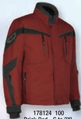
178124 100 Brick Red - S to 2XL