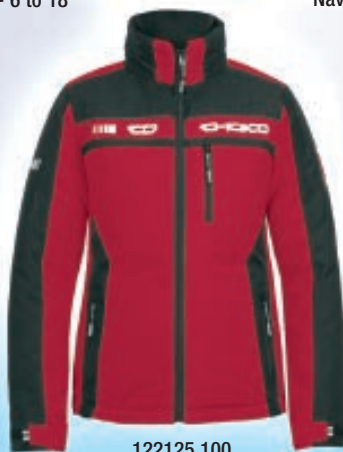
122125 100 Chili Pepper - 6 to 18