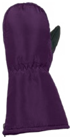
PLUM # 222201 3D sizes s to l (2 to 6)