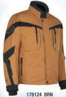
178124 BRN Bear Brown - S to 2XL