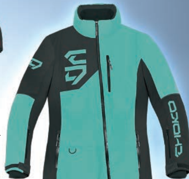
183724 500 Black / Lake Green XS to 2XL