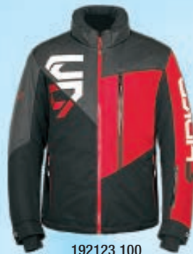
192123 100 Red - S to 2XL