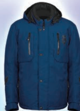
195125 200 Navy - S to 2XL