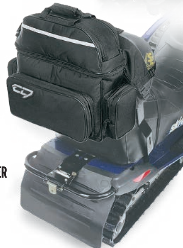
DELUXE 2-UP BACKREST BAG WITH BEVERAGE HOLDER