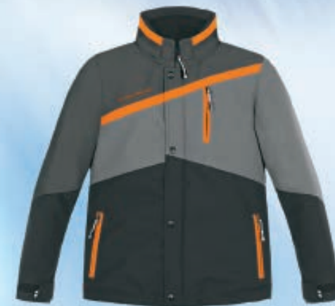
121824 900 Grey - 8 to 18