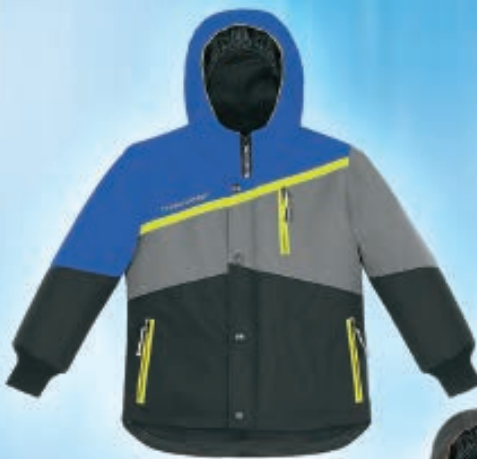
111824 200 Royal - 2 to 6X