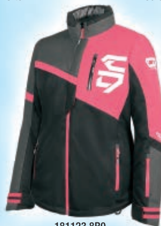
181123 8R0 Rose Red - XS to 2XL

REMOVABLE ZIP OUT LINER EASY ONE STEP SYSTEM INNOVATION BY CHOKO