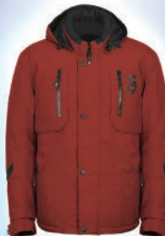
195125 100 Brick Red - S to 2XL