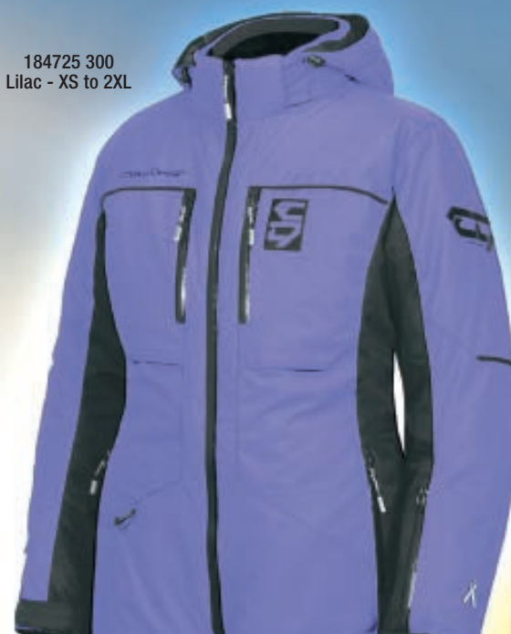
184725 300 Lilac - XS to 2XL