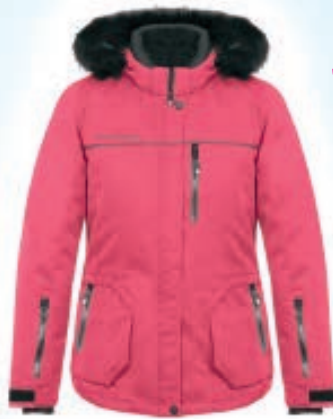
187125 800 Rose Red - XS to 2XL