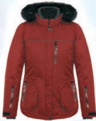
187125 100 Brick Red - XS to 2XL