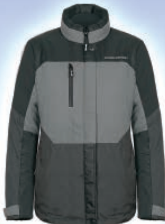
189824 900 Grey - XS to 2XL