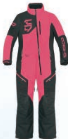
183724 8R0 Rose Red - XS to 2XL