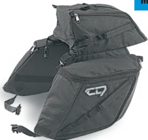
POLARIS AXYS SADDLEBAG # 204251 00 CA$99.95