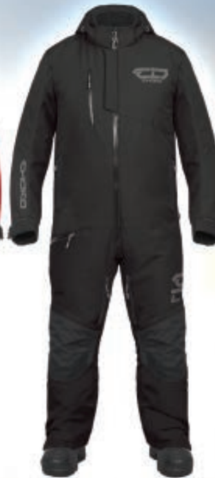
190725 000 Black - S to 2XL