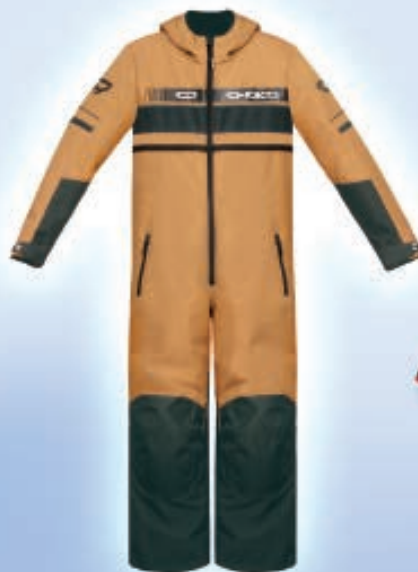
126725 BRN Bear Brown - 6 to 18