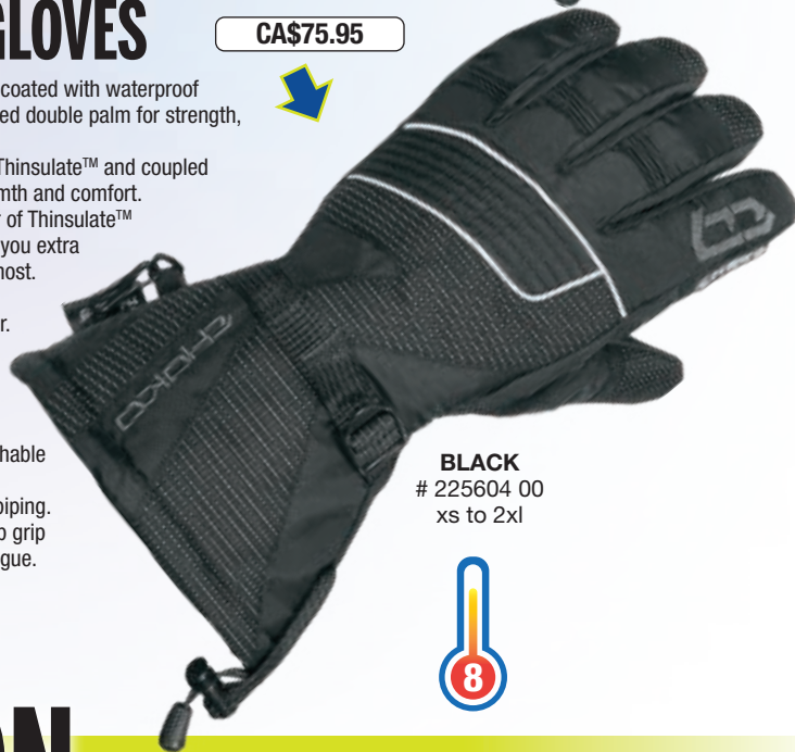
BLACK # 225604 00 xs to 2xl