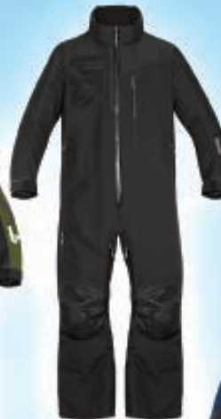
191724 000 Black - S to 3XL