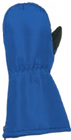
ROYAL # 222201 20 sizes s to l (2 to 6)