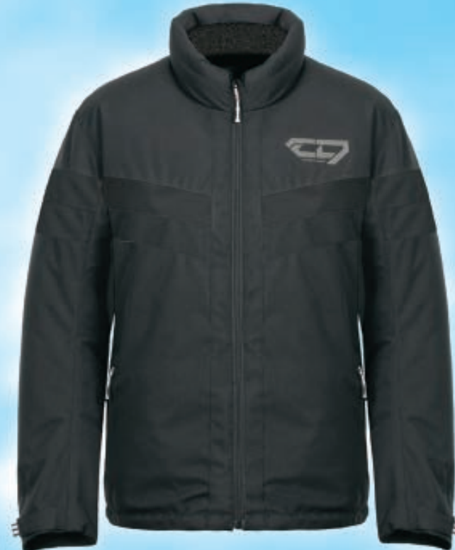
194125 000 Black - S to 3XL