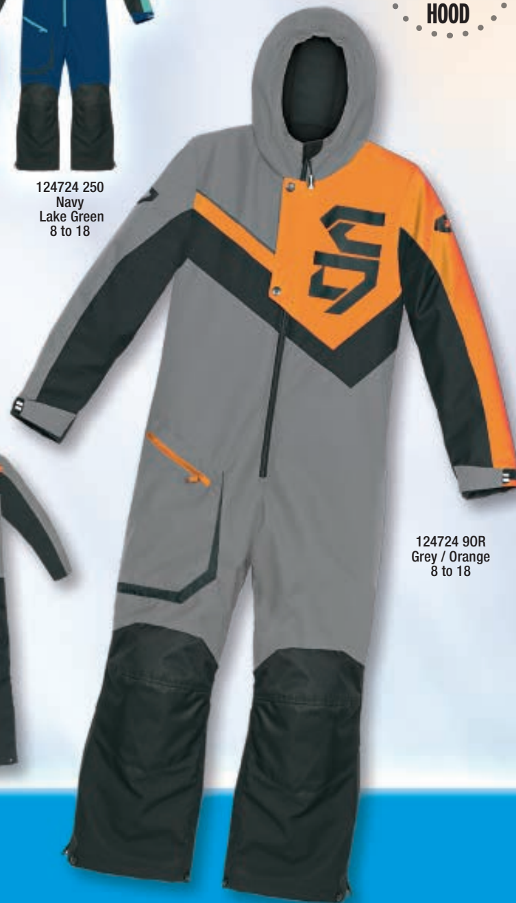
124724 90R Grey / Orange 8 to 18