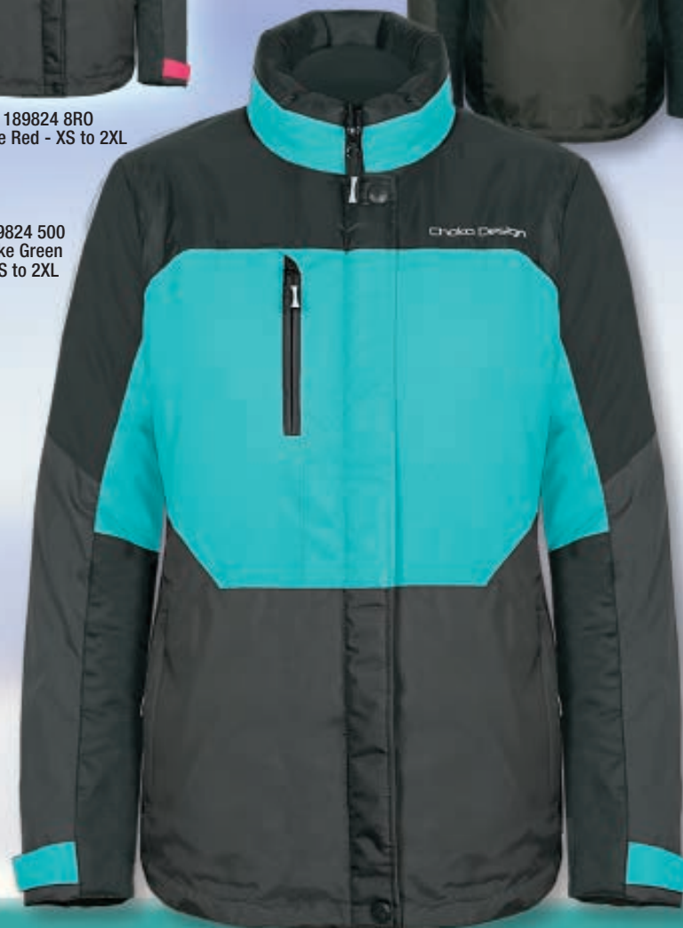
189824 500 Lake Green XS to 2XL