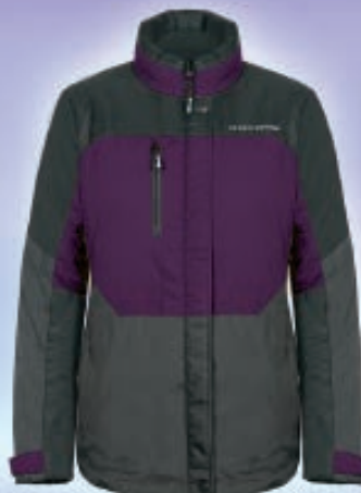
189824 3DK Plum - XS to 2XL