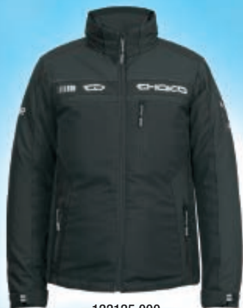
122125 000 Black - 6 to 18