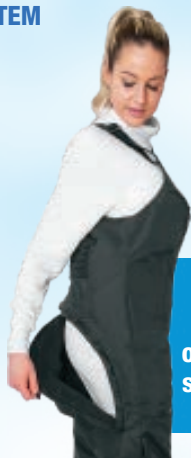
New zipper drop-seat opening for a slimmer look