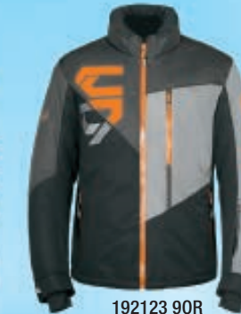
192123 90R Grey/Orange - S to 2XL