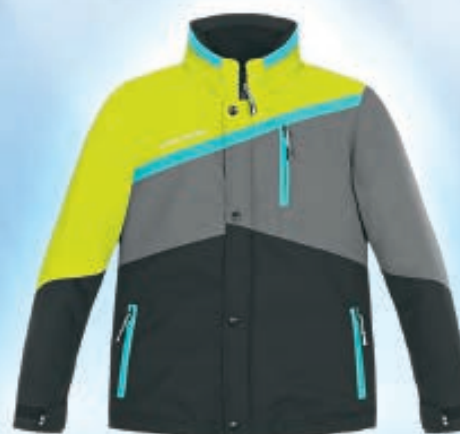
121824 SFT Safety Lime - 8 to 18