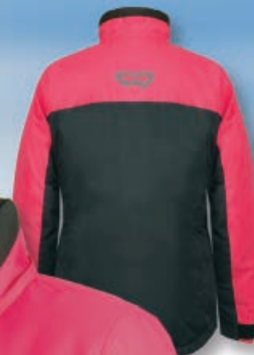
185825 8R0 Rose Red XS to 2XL