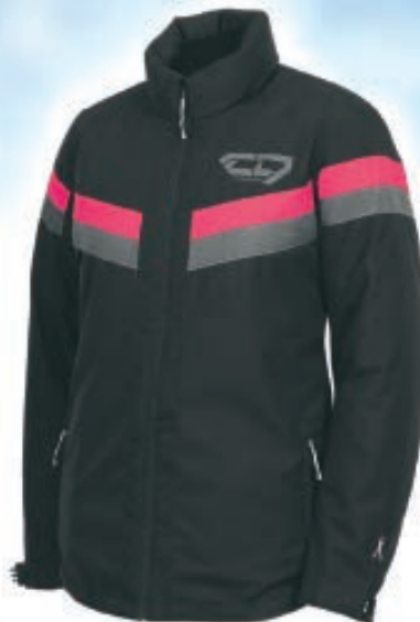
183125 8R0 Rose Red - XS to 2XL