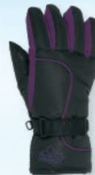
PLUM # 3D