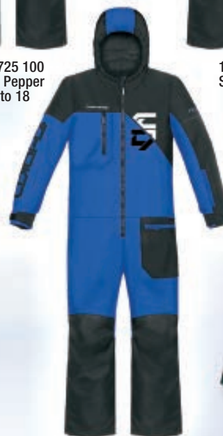
120725 200 Royal - 6 to 18