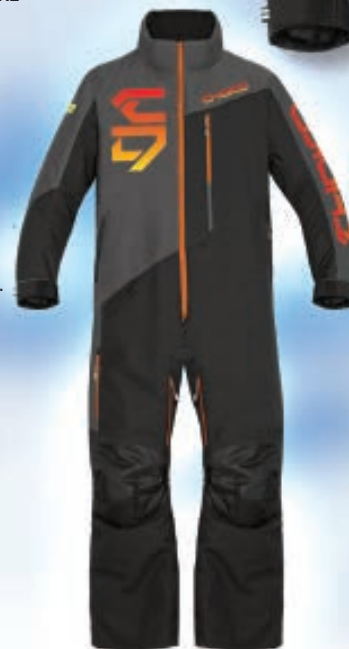
191724 09H Black/Grey/Flame print S to 3XL