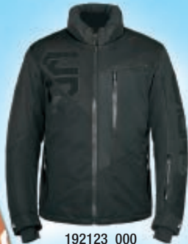
192123 000 Black - S to 3XL