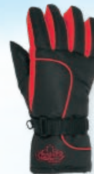
RED # 10