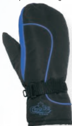
ROYAL # 20