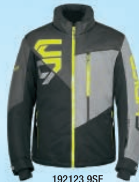
192123 9SF Grey/Safety Lime - S to 2XL