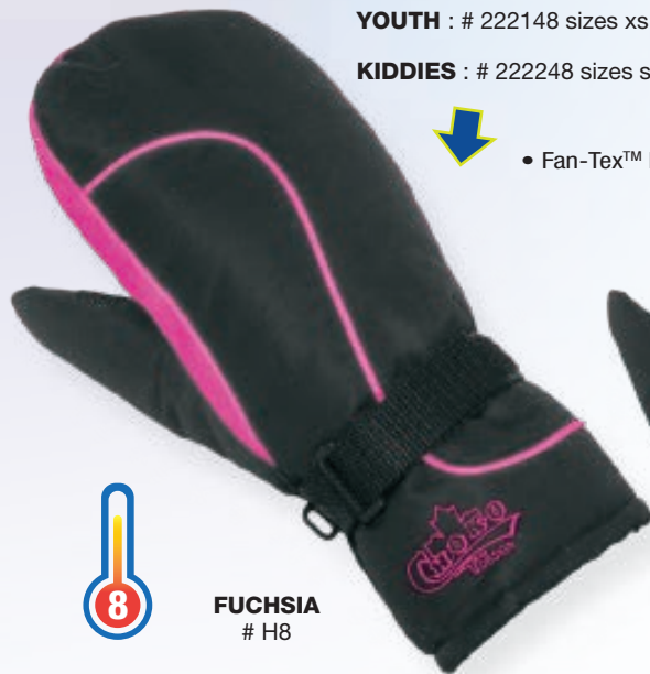
FUCHSIA # H8