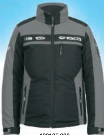
122125 900 Grey - 6 to 18