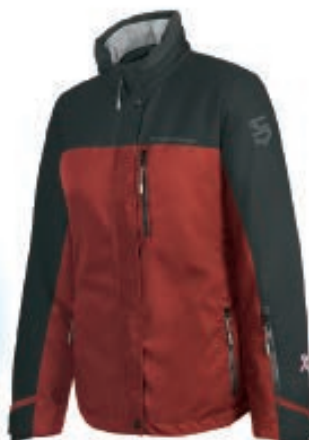
185825 010 Chili Pepper - XS to 3XL