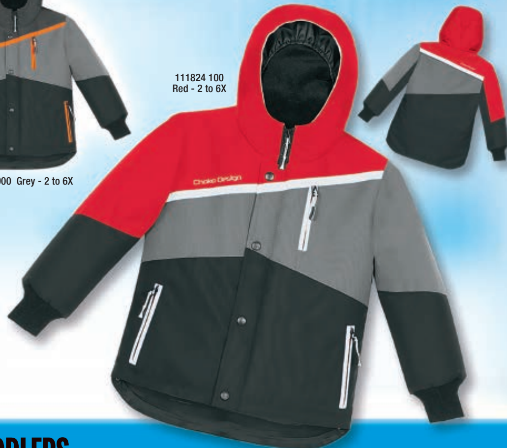
111824 100 Red - 2 to 6X