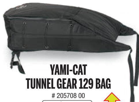
YAMI-CAT TUNNEL GEAR 129 BAG # 205708 00 CA$134.95