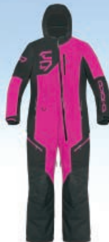
183724 H80 Fuchsia - XS to 2XL