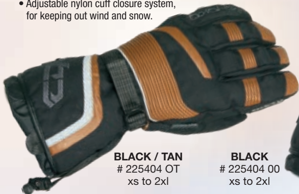
BLACK / TAN # 225404 OT xs to 2xl