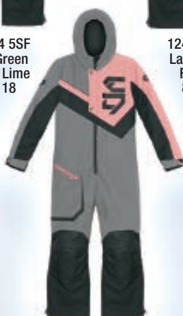
124724 9C0 Grey / Coral - 8 to 18