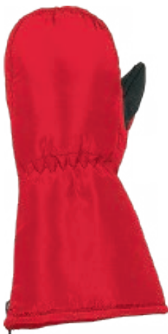
RED # 222201 10 sizes s to l (2 to 6)