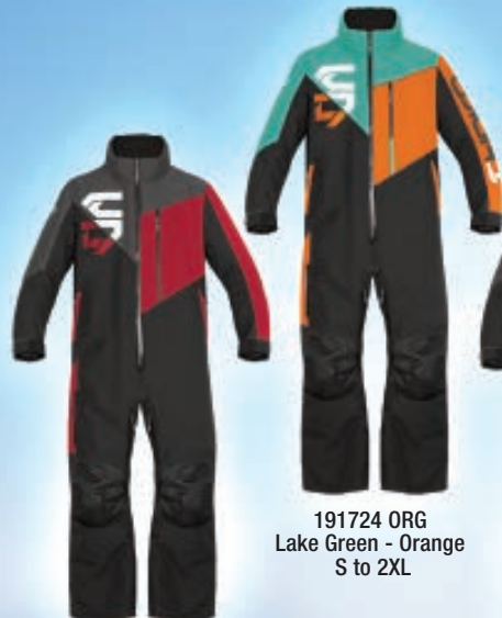
191724 110 Chili Pepper - S to 2XL