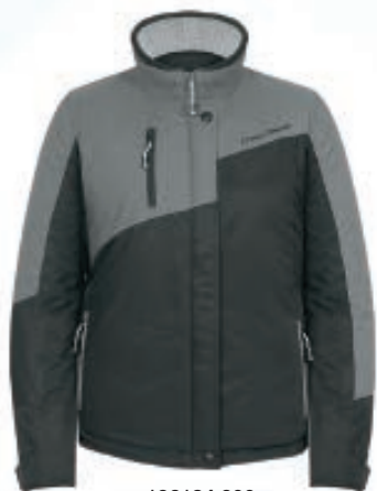
186124 900 Grey - XS to 2XL