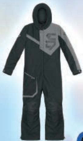
124724 009 Black / Grey 8 to 18