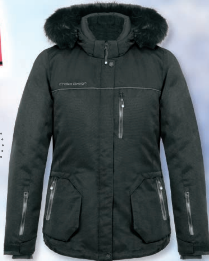
187125 000 Black - XS to 4XL