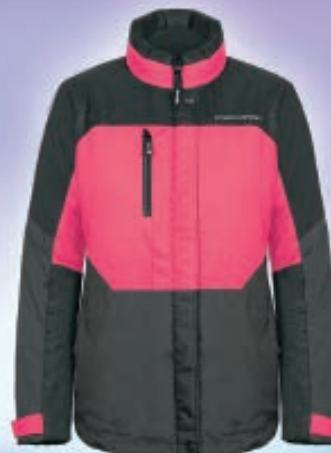
189824 8R0 Rose Red - XS to 2XL