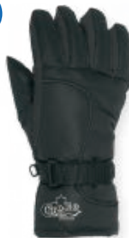
BLACK # 00