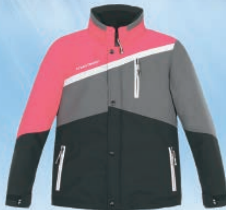
121824 8R0 Rose Red - 8 to 18