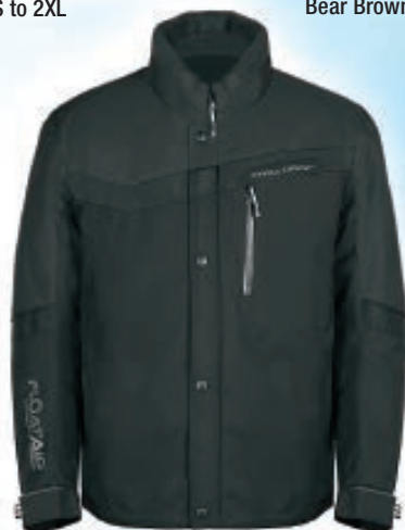
196124 000 Black - S to 7XL