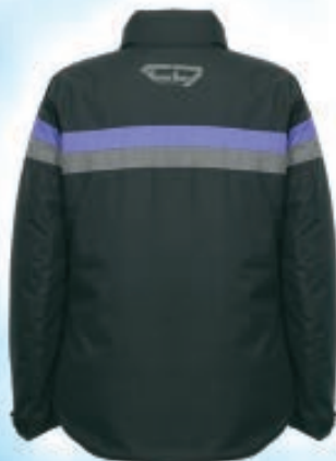
183125 300 Lilac XS to 2XL