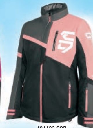
181123 COR Coral - XS to 2XL