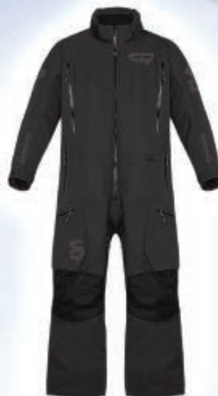
170724 000 Black S to 3XL

TECHNICALLY DESIGNED WITH 4 POINTS VENTILATION SYSTEM • POWER PLEATED BACK STRETCH PANEL FOR EASY MOVEMENT