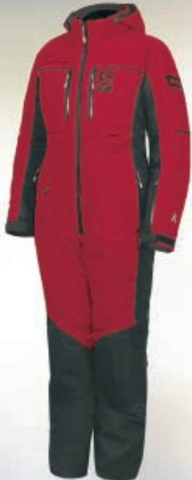
184725 100 Chili Pepper - XS to 2XL