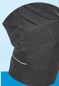
Triple padded articulated knee patches with power pleating