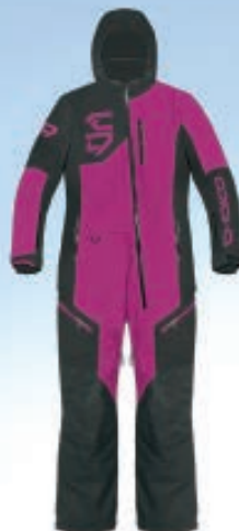
183724 BRY Berry - XS to 2XL