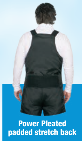
Power Pleated padded stretch back