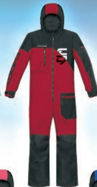
120725 100 Chili Pepper 6 to 18