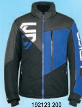
192123 200 Royal - S to 2XL