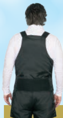
Power Pleated padded stretch back