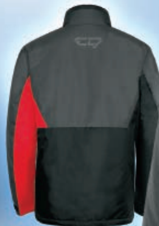
199824 100 Red - S to 2XL