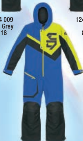
124724 200 Royal - 8 to 18