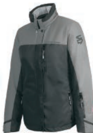
185825 900 Grey - XS to 2XL