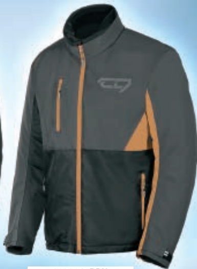
199824 BRN Bear Brown - S to 2XL