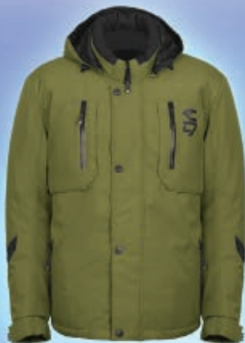
195125 0LV Olive - S to 2XL