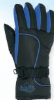
ROYAL # 20