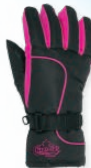
FUCHSIA # H8