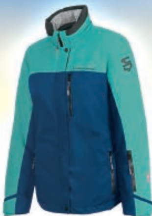
185825 250 Navy Lake Green - XS to 2XL