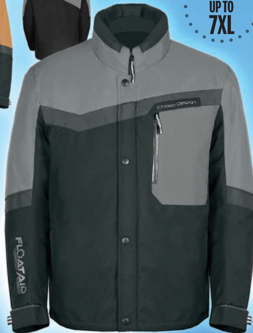
196124 900 Grey - S to 5XL