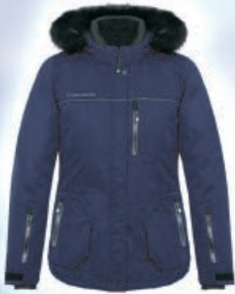
187125 200 Navy - XS to 2XL