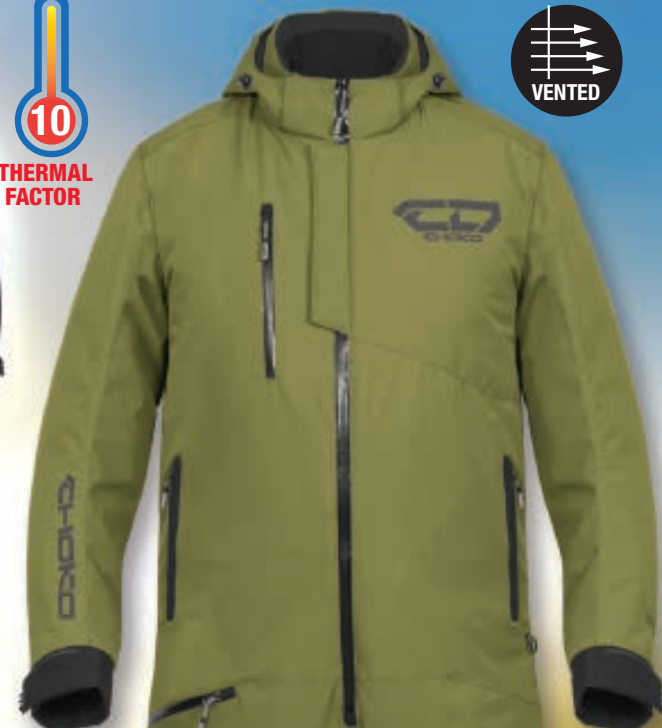
190724 OLV Olive - S to 22XL