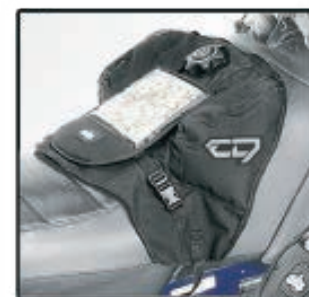
DELUXE 3x1 GAS TANK BRA/ DETACHABLE BAG & MAP POUCH # 203508 00 CA$110.95