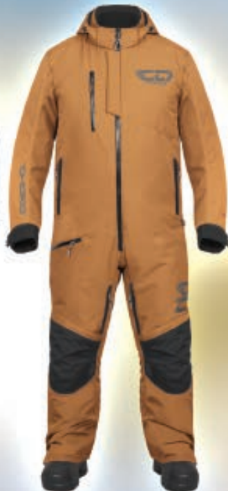
190725 BRN Bear Brown - S to 2XL