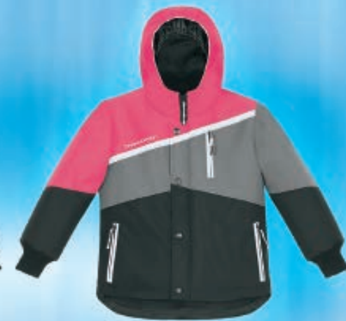
111824 8R0 Rose Red - 2 to 6X