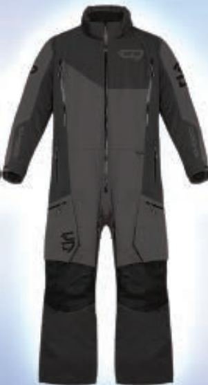
170724 900 Grey S to 2XL