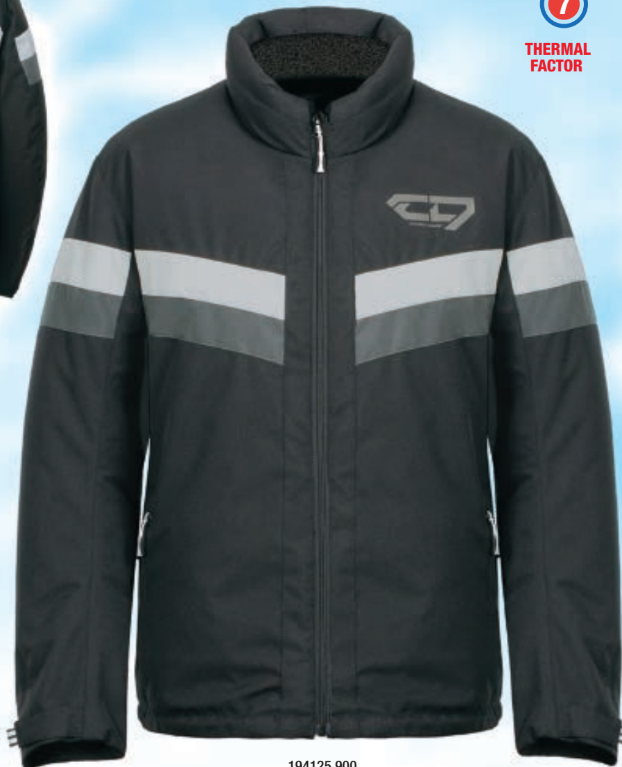
194125 900 Grey - S to 2XL