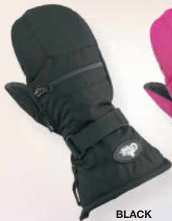
BLACK # 222108 00 xs to xl (8 to 16)