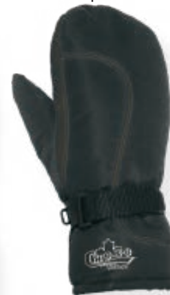
BLACK # 00