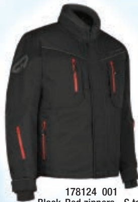
178124 001 Black-Red zippers - S to 2XL