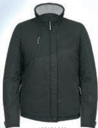
186124 000 Black - XS to 3XL