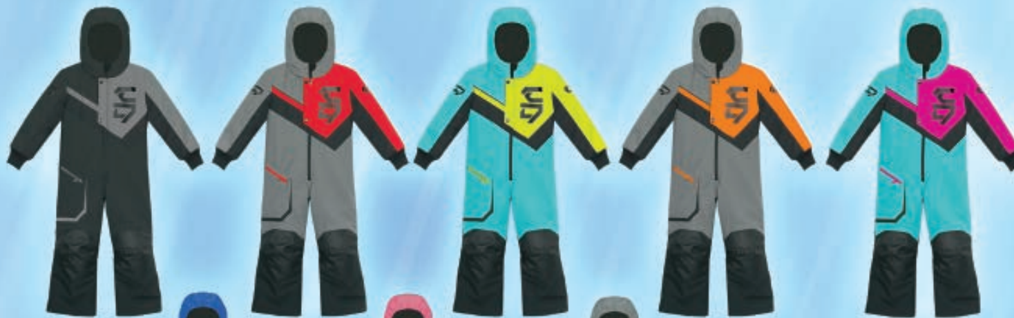
114724 009 Black/Grey 2 to 6X