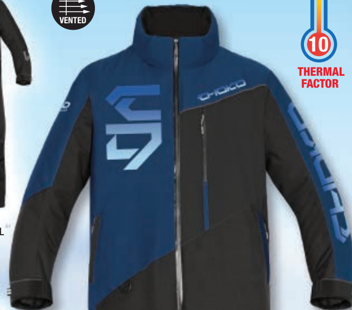
191724 02H Black/Grey Blue Print S to 2XL