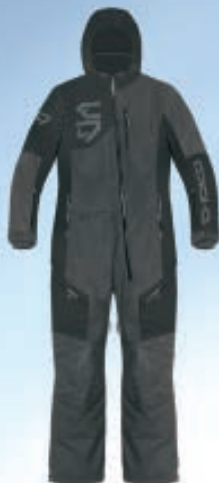
183724 900 Dark Grey - XS to 2XL