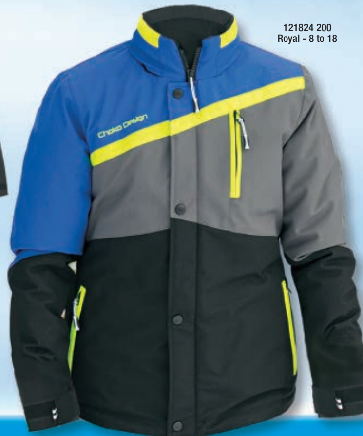
121824 200 Royal - 8 to 18