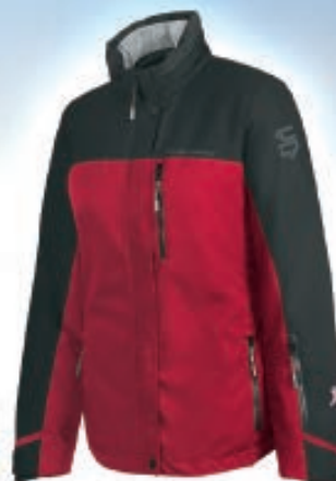
185825 100 Brick Red - XS to 3XL